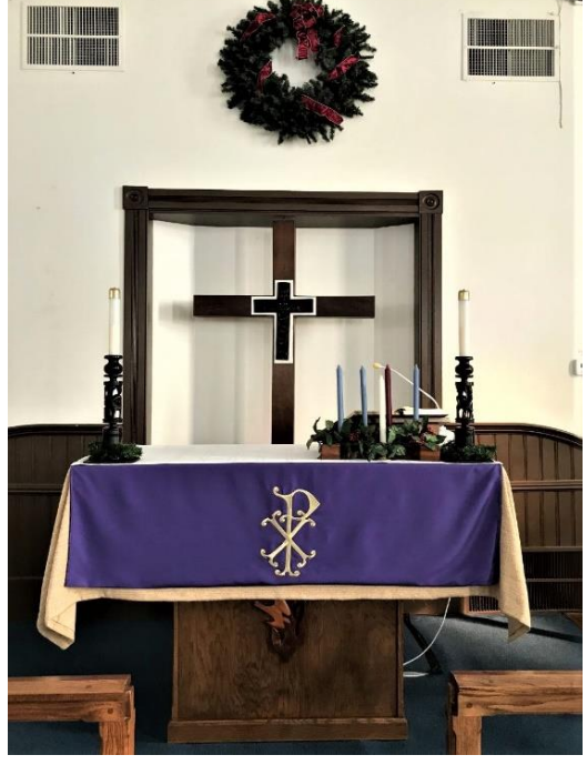
The Altar with the Advent Wreath