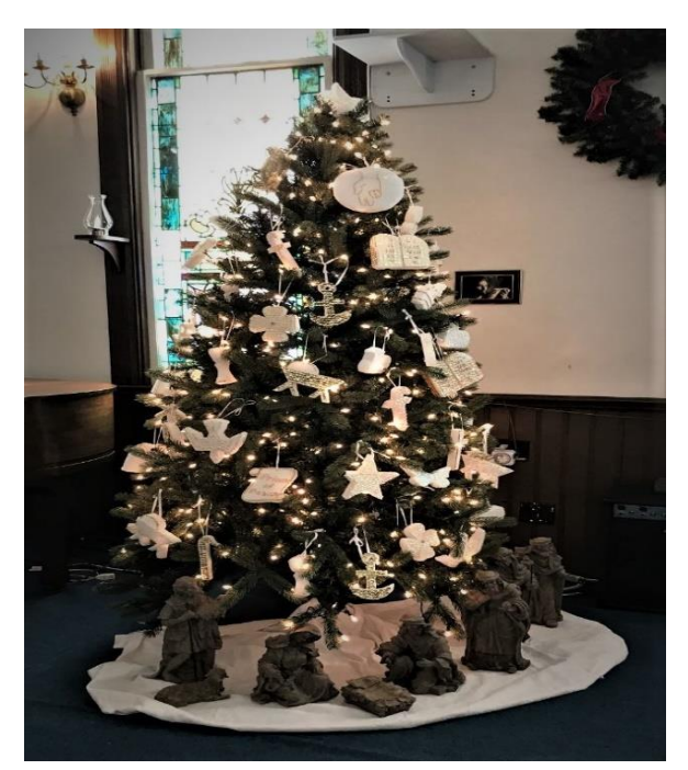
The tree with the NativityBruce and Pastor admire the resultsWe are grateful for all that came and supported this wonderful project!